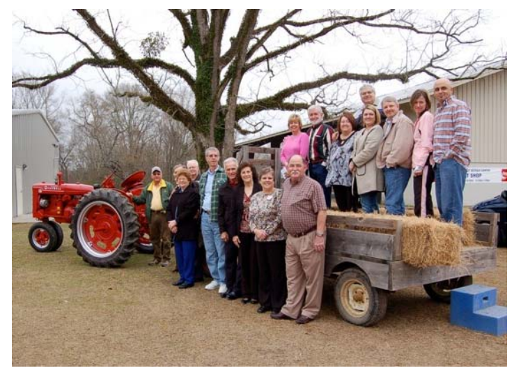
Bi-vo / Small Church Pastors & Wives Retreat