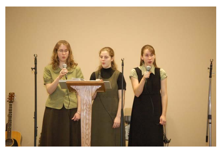
The Tero Family.