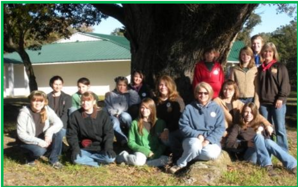
Mother / Daughter Equestrian Camp

For further information, availability, or cost details, please check out our website: www.bagbr.org/retreatcenter.htm . You may also call us at (225) 634-7225.